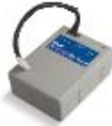
PS124 24V battery with built-in battery charger