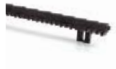
ROA6 M4 25x20x1000mm slotted nylon rack with metal insert