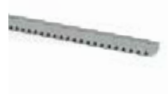
ROA7 M4 rack, zinc coated, 22x22x1000mm